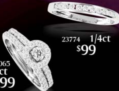
22065 1ct $399